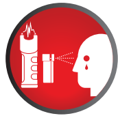
Pepper spray Mace Taser