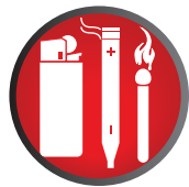
Lighter, e-Cigarette or matches in checked baggage