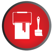
Paint Paint thinner