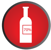
Alcohol exceeding 70%