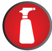
Household chemicals Corrosives such as acid alkalis, item with mercury