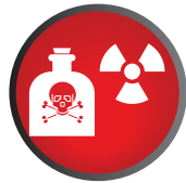
Infectious substances Radioactive material