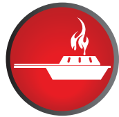
Fuel paste flammable liquids