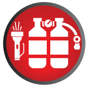
Oxygen cylinders Under water torch